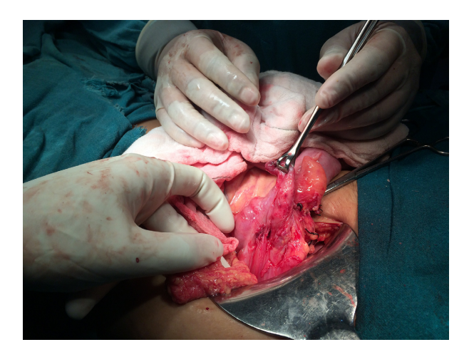
Figure 2. Stump appendicitis with ileocecal junction in view.

residual portion of the appendix left behind. The clinical presentation of stump appendicitis is similar to that of acute appendicitis [5]. Stump appendicitis has an incidence of one in 50,000 cases [6]. Clinically, these patients have the symptoms and signs similar to appendicitis. Stump appendicitis poses a dilemma if the clinician is not aware of this uncommon presentation.