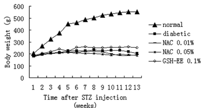
Figure 2. Changes of rat's bodyweight before and after the injection of streptozotocin. Data are the average of results in all the animals in a given group. The weights of the normal rats were significantly different from the four diabetic groups ( p < 0.05 ), and there were no significant differences between the four diabetic groups ( p > 0.05 ) at any time.

Grading of lens opacification: The onset of cataract was observed after two weeks by slit lamp examination. The median calculation of lens opacity was presented in Table 2. All the lenses in group I appeared to be clear and normal throughout the experimental period whereas after four weeks, only 30% of the lenses were in grade 1, 60% in grade 2, 10% in grade 3 of cataract formation, and none of them were clear (grade 0; Table 2) in group V, the untreated diabetic rats. However, on the fourth week, more than 50% of the lenses were clear in groups II and IV whereas in group V, most of the lenses were in grade 2 and only a few were clear ( p < 0.05 ; Table 2). After five weeks, lens opacification became worse in groups II-V with no significant difference between the diabetic groups, treated and untreated ( p > 0.05 ; Table 2).