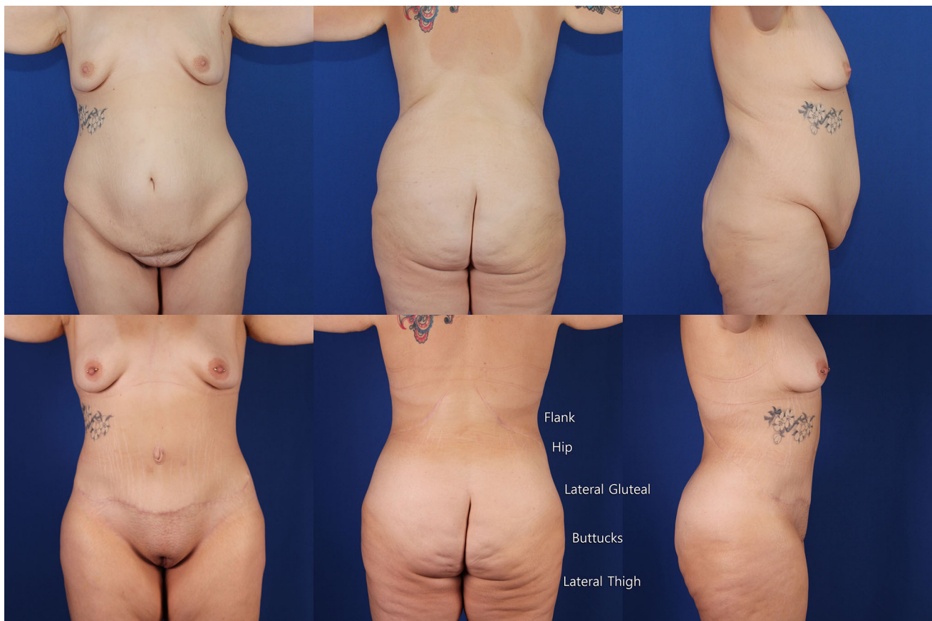
Fig. 1 A selected case from senior discussant with deformity shown in upper row like Fig. 2 in Lipo-Bodylift. Lower row are same views 8 months following oblique flankplasty with lipoabdominoplasty (OFLA) and lipoaugmentation of the breasts, which should be

compared to views in lower row Fig. 2 Lipo-Bodylift. The post-operative lower posterior view is labelled with right flank, hip, lateral gluteal, buttock and lateral thigh, which were preoperatively obscured by hanging tissues and are now distinct and attractively seen