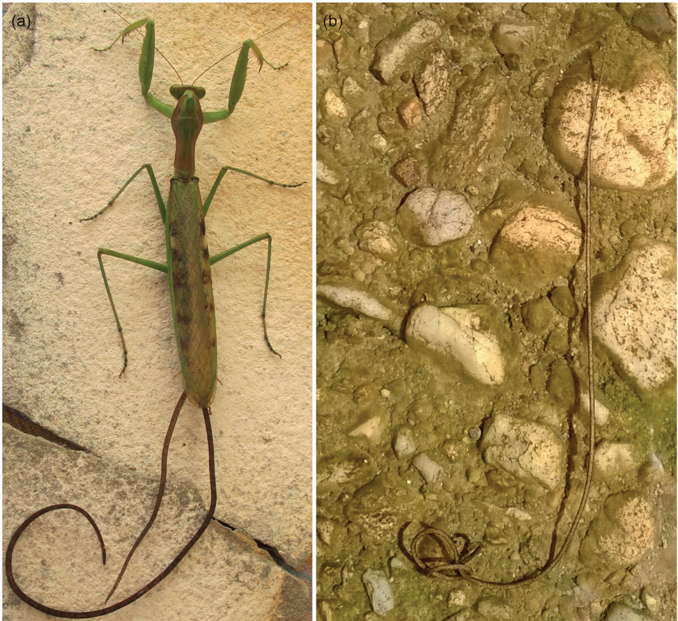
Figure 1. Chordodes ferox : a two specimens emerging from the posterior end of the praying mantid Poly-spilota aeruginosa b free-living specimen on rocky substrata underwater showing a curled posterior end. Photos: Lynette Clennell, March 2015.

Specimens are deposited in the Zoological Museum in the Centrum für Naturkunde of the University Hamburg under the numbers ZMH13363-ZMH13366.