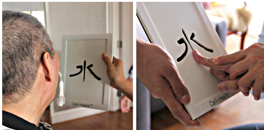
Figure 4 Calligraphy training being conducted on the patient with the help of three nursing staff. One helped him to sit up and position his head upright, the second one helped and directed his attention and showed him to focus on the task character (top left), and the third one held his index finger and ran it through the strokes of the Chinese character on the board (top right).