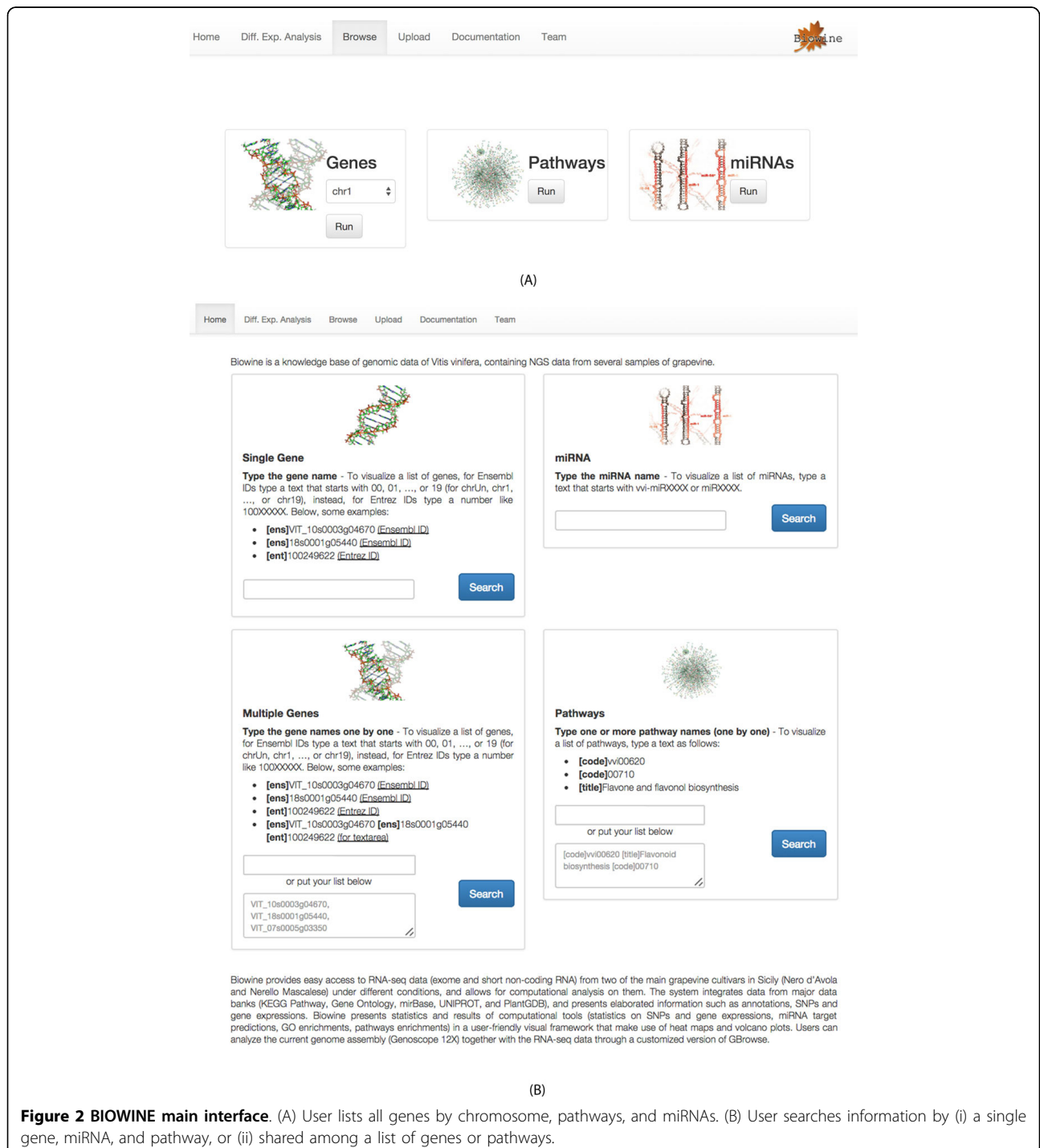
Figure 2 BLOWINE main interface. (A) User lists all genes by chromosome, pathways, and miRNAs. (B) User searches information by (i) a single gene, miRNA, and pathway, or (ii) shared among a list of genes or pathways.

Search by multiple genes. The search by multiple genes works by pasting a list of genes (see Figure 2 (B)). The search can be done either by gene names (e.g. VvMYBA1) or by external identifiers from NCBI or EBI.