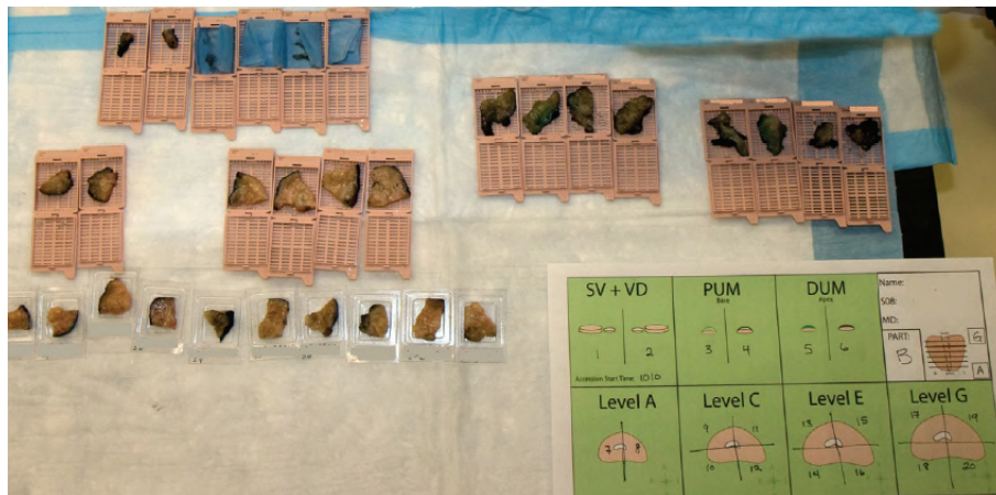
Figure 2 A photograph showing the labelled cassettes of prostate tissue from a single prostate specimen prior to snap freezing.

blood loss, total WIT (including intraoperative time, collection time and processing time), total operating time, and storage time (number of months between flash freezing and RNA extraction). Subgroup analysis was performed using the student t-test for the statistically significant variables included in the best model. All statistical analysis was performed using SPSS (v18.0 for Windows; IBM, Armonk, NY).