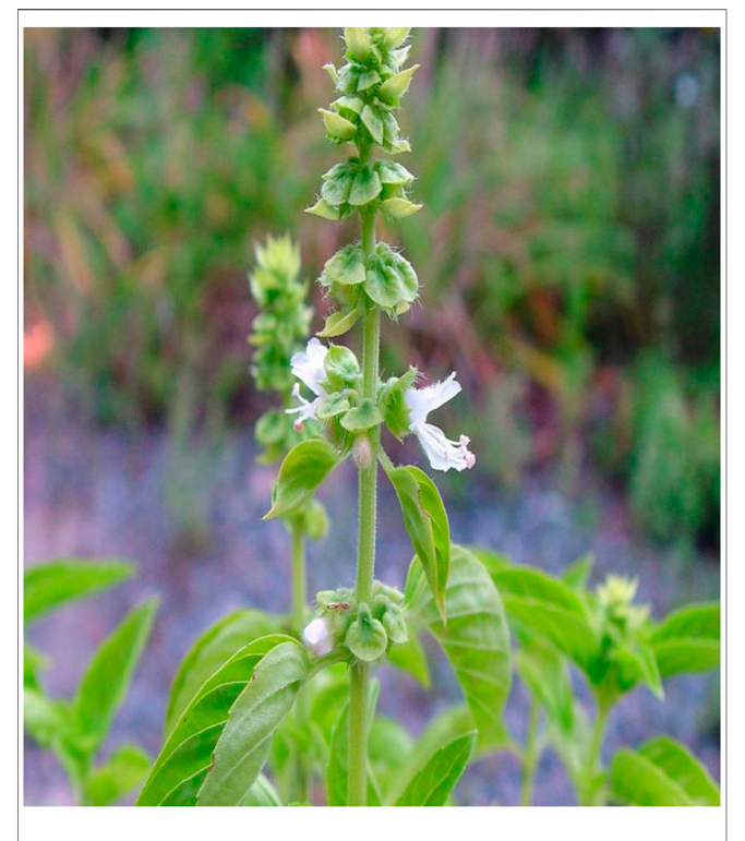
FIGURE 1 | Natural view of Ocimum basilicum.

mainly by two types of drugs, including relieving drugs that reduce airway obstruction and preventive drugs that reduce lung inflammation (Rabe and Schmidt, 2001).