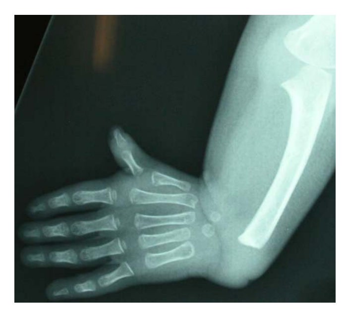
Fig. (1). Anteroposterior X-ray showing the complete absence of the radius with the presence of the thumb.

Due to the importance of the embryology in the understanding the basis of human diseases with RDs, the next paragraph will present the main events in upper limb development.