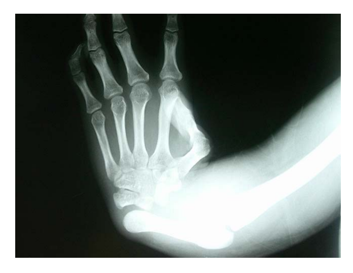
Fig. (5). Anteroposterior X-ray of a patient affected by TAR syndrome showing complete aplasia of the radius and a triphalangeal thumb.

The thrombocytopenia-absent radius syndrome (TAR) was firstly defined as a syndrome in a study by Hall et al. (1969), who presented the clinical findings of a cohort of 40 patients [132]. It is a rare disease, with an incidence of approximately 1 in 240 000 birth [133], characterized by the absence of the radius in each forearm with the presence of the thumbs (this feature distinguishes TAR from other syndromes such as Fanconi anemia) (Fig. 5) and by reduction in the number of platelets (<50 platelets/nL) due to a decreased bone marrow production. Affected individuals frequently present with bleeding episodes in the first year of life that become less severe over time; in some cases the platelet levels become normal [132, 134]. TAR syndrome is also featured by short stature and additional skeletal anomalies, whose severity varies from absence of radii to virtual absence of upper limbs, with or without lower limb defects such as hip dysplasia, genua vara, and bowing of the long bones [12, 135, 136]. In a series of 34 TAR patients, renal and cardiac anomalies have been described in 23% and 15% of cases, respectively [137].