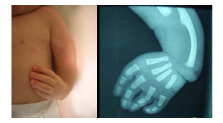
Fig. (2). Clinical photograph ( A ) and anteroposterior X-ray ( B ) of a patient affected by VACTERL association showing a complete aplasia of both radius and thumb.

Limb malformations are reported in approximately 40-50% of patients [58, 59] and are typically described as radial anomalies, including thumb and radial aplasia/hypoplasia with a wide range of severity (Fig. 2). In a recent study by Carli et al. (2014) on a cohort of 25 VACTERL patients selected for their upper limb involvement, the thumb was always affected: its function was severely impaired in 79% of all the cases and in about one third it was associated with aplasia of the radius. Approximately 75% of patients had a unilateral anomaly and when bilateral, the RD was always non symmetrical [9]. Of note, the authors describe that in two cases the radial anomaly was represented by a thumb duplication (in both cases the contralateral thumb was hypoplastic or absent), consistent with the above-reported hypothesis of a common embryological basis for thumb hypoplasia and duplication [38].