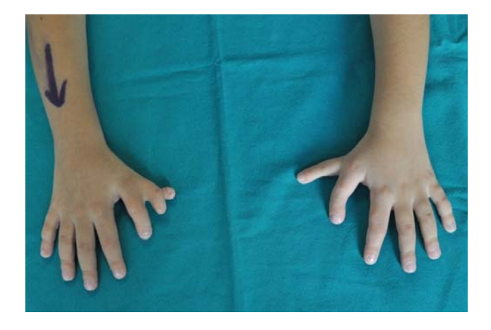
Fig. (6). Clinical photograph of bilateral thumb duplication in a patient affected by Townes-Brocks Syndrome.

with a variable pattern of malformation including imperforate anus, abnormally shaped ears and thumb anomalies, which can be hypoplastic, duplicated or triphalangeal (Fig. 6). Other possible signs and symptoms include kidney and heart abnormalities, mild to profound hearing loss, eye anomalies and genital malformations [158]. These features vary among affected individuals, even within the same family. Intellectual disability or learning problems have also been reported in about 20 percent of affected patients and occasionally endocrine abnormalities, i.e. growth hormone deficiency and hypothyroidism [159]. The prevalence is unknown, partly because the clinical diagnosis of Townes-Brocks syndrome is often complicated by an overlap with VACTERL association, which may lead to an overascertainment of TBS prevalence. Martinez-Frias estimated the prevalence at 1:250,000 but he did not use stringent diagnostic criteria for TBS [160].