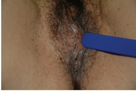
FIGURE 1: Dark-brown macules in the labia major.