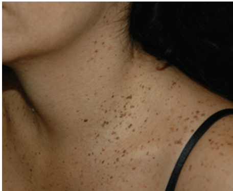
FIGURE 2: Multiple seborrheic keratosis over the patients' neck and upper trunk.

been described, including dystrophic fingernails, multiple keratoacanthomas, pilonidal sinus, seborrheic keratosis, and hidradenitis suppurativa [4].