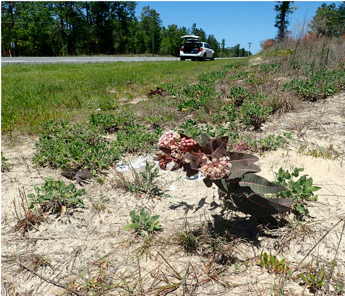
Figure 3. Road verge showing a population of pinewoods milkweed ( Asclepias humistrata ) with plants growing on the back upward sloped portion where exposed sand occurs.

Based on the survey data, plant densities ranged from 1 to (an estimated) 500 individuals per site. As a result, plant locations were subsequently categorized as either high or low density. This was done for the purposes of identifying proposed priority locations for evaluating current and future vegetation management (e.g., mowing, selective herbicide application). Sites were considered high density if they contained at least 1 plant for every 2 m of road verge and were at least 10 m in overall length (parallel to the road) from the first plant to the last plant. Alternatively, sites were considered low density if they failed to meet one or both of these requirements. Based on these criteria, a total of 35 A. humistrata and 0 A. tuberosa locations were characterized as high density, proposed priority locations (Figure 1). As A. tuberosa is more likely to occur singly and is much more difficult to immediately identify in the landscape from a distance unless in flower, the lower numbers recorded may be an artifact related to detectability.