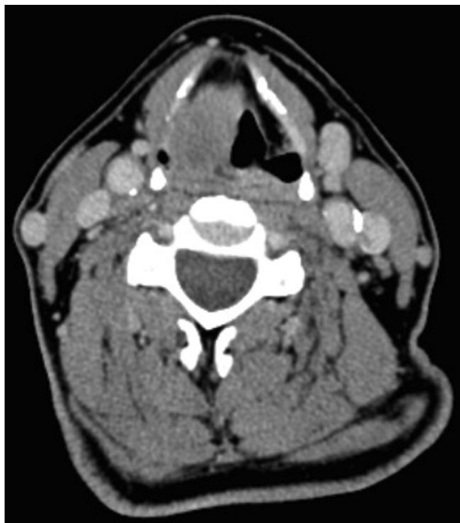
Fig. 1. Cervical CT. Tumor in the right hemilarynx, without cervical adenopathy.

packet a day. He presented with dysphonia as his only symptom in November 2013. Fibroscopy revealed paralysis of the right vocal fold and an edematous lesion of the right ventricular band. No cervical lymphadenopathies were present in the physical examination.