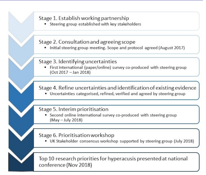
Figure 1 The six-stage methodological process for the hyperacusis priority setting partnership.

established and pragmatic processes for prioritising health research questions. The JLA guiding principles are to bring together patients, carers and healthcare professionals in priority setting partnerships (PSP) to identify and agree priorities for research. The JLA provides established step-by-step methodology to manage and complete a PSP, and ensures that all processes are accountable and transparent.