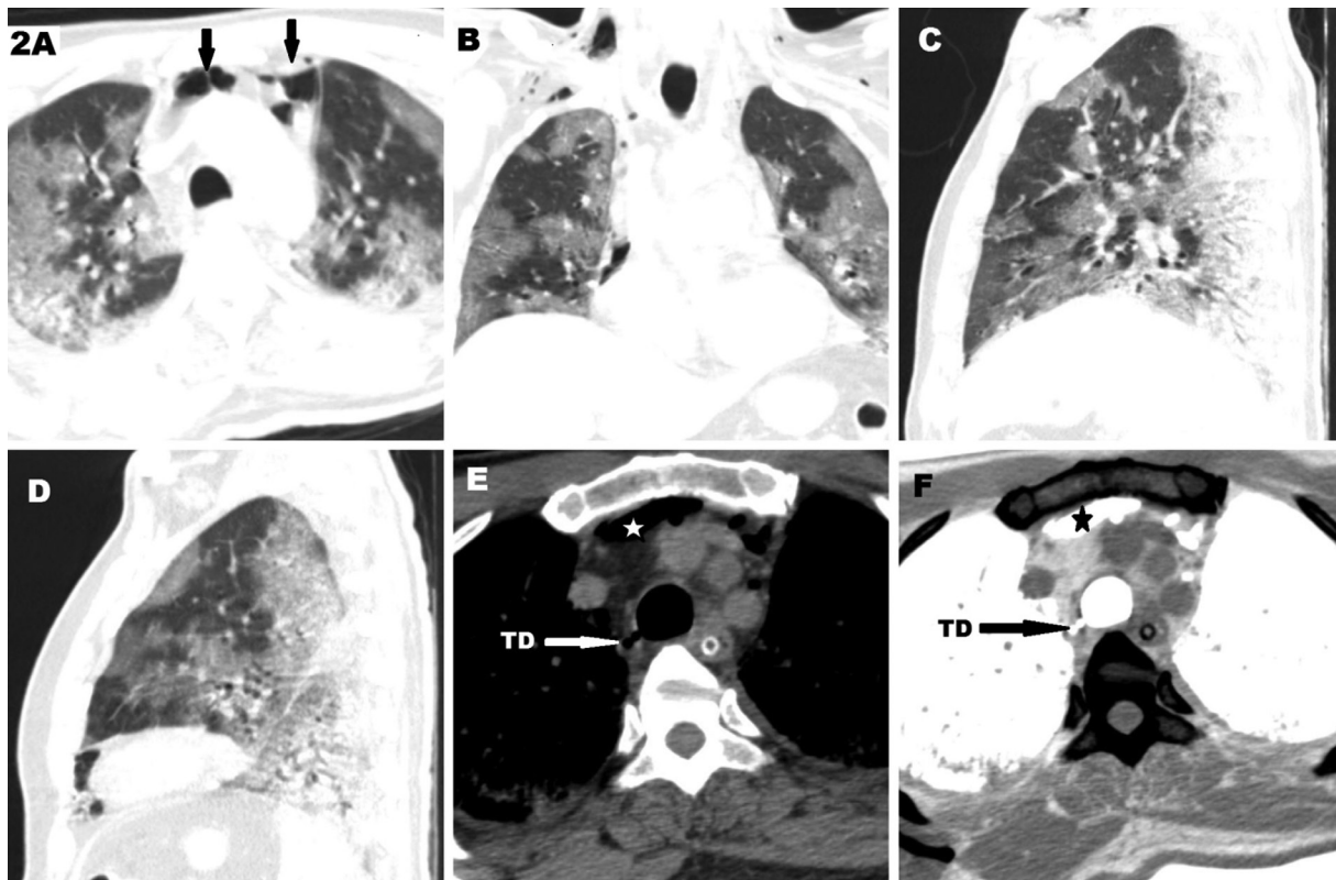
Figure 2. CT scan of a 54-year-old male with severe Covid 19 pneumonia. A. axial CT scan in lung window showing multiple peripheral ground glassing with pneumomediastinum (arrows) . B–D. Coronal, Sagittal of right lung and Sagittal of left lung respectively showing peripheral ground glassings typical of covid 19 pneumonia. E. Axial CT scan in mediastinal window showing tracheal diverticulum (TD) and pneumomediastinum (star). F. Inverted CT image of the same showing better depiction of the diverticulum (TD).

He worsened clinically and finally succumbed to the disease on the 15 th day of admission.