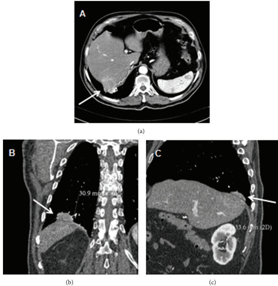
FIGURE 1: Axial (a), coronal (b), and sagittal (c) images from a computed tomography of neck, thorax, and abdomen with intravenous contrast demonstrating a nodular image close to the diaphragm, in the right side, with transdiaphragmatic infiltration, hepatic invasion, and arterial vascularization ( arrows ).