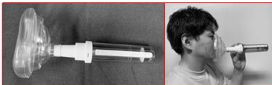
Figure 3. Photographs of the peak nasal inspiratory flow (PNIF) meter and its use.

applying the BR to the nasal bridge. This process permitted objective evaluation of inspiratory flow rates. For the control condition, PNIF was measured with 'no appliance'. We recorded PNIF using an inspiratory flow meter (In-check™, Clement Clarke International Limited, Harlow, UK) (Figure 3). During the test, participants were instructed to inhale maximally through the nasal passage after exhaling completely in a sitting position with the mouth closed. The mean of three trials was recorded. The appliances were applied in a random order. As a safety check, an otolaryngologist examined the participants at the end of each session to assess the presence or absence of pain, discomfort, bleeding, or lacerations in the nasal cavity.