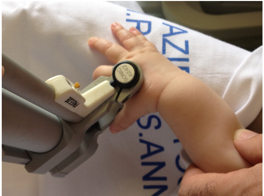
Figure 1 Application procedure.