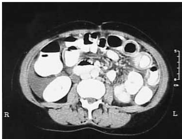
Figure 1 - Abdominal computerized tomography showing dilated bowel, focal or diffuse bowel wall thickening, and abnormal bowel wall enhancement (a double halo or target sign).

Methylprednisolone (50 mg/day, intravenous) was initiated, and the patient showed clinical improvement and became asymptomatic after four days. A new abdominal CT was performed to evaluate her progress, and the results