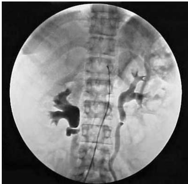
Figure 3 - Delayed arteriography phase showing hydronephrosis on the right pyelocaliceal renal system.

were normal. After two weeks of corticosteroid therapy, intravenous cyclophosphamide (1 g) was given monthly for one year. The patient had a gradual and complete control of illness, thereby allowing the tapering of corticosteroid therapy. She also received cyclophosphamide pulse therapy twelve times in a period of one year. Currently, she is well and in SLE remission.