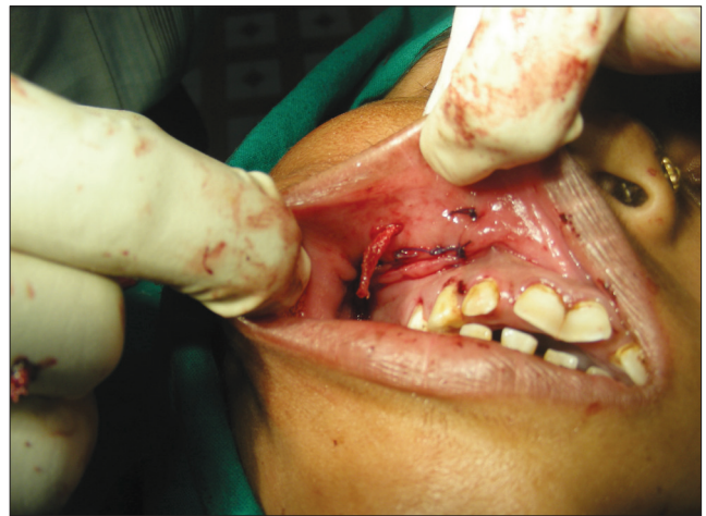
Figure 4: Incision closed pack removed through separate stab incision