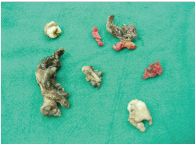
Figure 5: Pathological specimen with removed tooth

and the wound closed with 3.0 silk suture [Figure 5]. The pack was removed on 3 rd postoperative day and primary closure was done. On the 10 th day, swelling completely subsided. Histopathology of the soft tissue revealed a dentigerous cyst with no evidence of