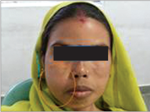
Figure 1: Swelling on right side of the face