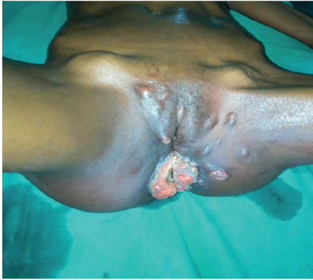
FIGURE 1: Anal margin tumor with perineal and vulvar permeation nodules and bilateral inguinal lymph nodes.