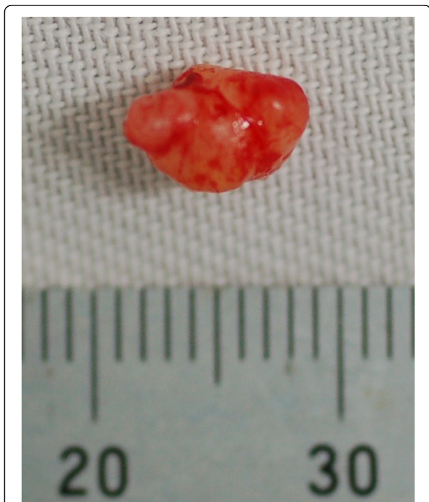
Figure 2 Gross examination of the excised specimen, showing an oval lesion with smooth surface.

muscle cells fascicles (Figure 4A and B) (positive immunoreactions for smooth muscle actin and desmin) and nervous tissue (Figure 4C) (positive immunoreaction for S-100). Finally, the patient was diagnosed with a nasopharyngeal leiomyomatous hamartoma. To date, almost