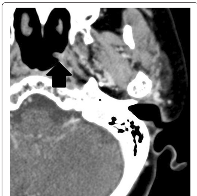
Figure 1 Axial CT images, revealing a small mass almost 5 mm in diameter at the left wall of the nasopharynx.

muscle cells fascicles (Figure 4A and B) (positive immunoreactions for smooth muscle actin and desmin) and nervous tissue (Figure 4C) (positive immunoreaction for S-100). Finally, the patient was diagnosed with a nasopharyngeal leiomyomatous hamartoma. To date, almost