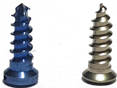
Fig. 1 2 mm diameter and 6 mm length self-tapping miniscrew (left) and drill-free miniscrew (right)

Ultrastructural studies demonstrate better screw-bone contact in DFS in comparison with STS, with better holding power, surrounded by biologically active bone debris [3, 4]. The actual gain from DFS may only seem theoretical as the facial skeleton is an assembly of bones with non-uniform cortical thicknesses and increased insertional torque may cause more harm in a practical scenario [5]. The present study has compared the intraoperative and postoperative performance of DFS to STS, in patients being treated with miniplate fixation for fractures of zygomaticomaxillary buttress (ZMB) and parasymphysis fracture of the mandible (PSM), to understand their feasibility for maxillofacial fracture fixation.