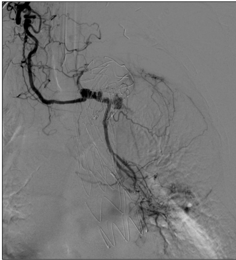
Fig. 1. Right Intercosto-bronchial Artery Derived from the Thyrocervical Trunk Post Thoracic Aortic Stenting Causing a Type II Endoleak.

idence of type II endoleaks following thoracic aortic stenting can be as high as 10.6% [1]. To our knowledge, only one similar report of a thyrocervical derived collateral causing a type II endoleak exists, described by Rivera-Sanfeliz et al. [2]. They describe a right thyrocervical trunk bronchial collateral, which is very similar to our description of an endoleak occurring in the intercostal bronchial artery. We strongly agree with their statement that the “examination of potential anomalous or collateral thoracic pathways is mandatory when considering treatment of a type II endoleak following endovascular TAA repair.”