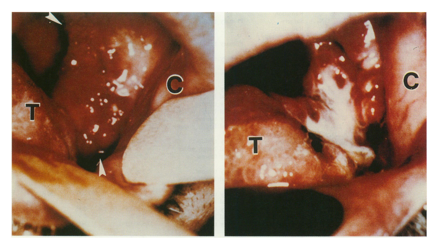
Figure 2 Recurrence of a tumour of the lateral floor of the mouth previously treated by surgery and radiotherapy (patient no. 17). Left: The day before the beginning of the IL-2 course. Right: Decrease and necrosis (white area) of the tumour 1 month after IL-2. T, tongue; C, cheek. The arrowheads indicate the border of the tumour mass.

rated as follows: CR, if the tumour was no longer evident; PR, if the sum of the products of the two major diameters of all lesions was reduced by more than 50%; minor response (MR), if the reduction was less than 50% but greater than 25%; no response (NR), absence of both response and progression; progression of the disease, appearance of new