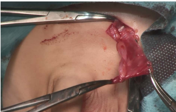
Figure 2: Intraoperative photograph (14 months of age). After opening the inguinal canal, only a patent processus vaginalis is visible.

Fowler–Stephens orchidopexy. Of 128 patients with nonpalpable testes in the scrotum, only a single patient at our institution had a peeping testis.