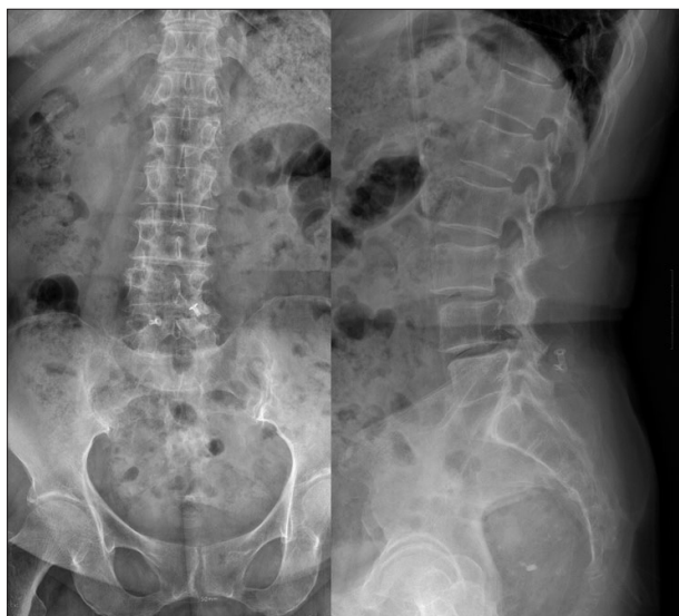
Fig. 1. Post-operative plain radiographs taken 5 years after DIAM insertion showed marked disc space collapse and scoliosis caused by left-side disc space collapse at L4–5, as compared to the immediate post-operative radiographs. Spondylolisthesis of L3 and L4 was also found. DIAM : device for intervertebral assisted motion.