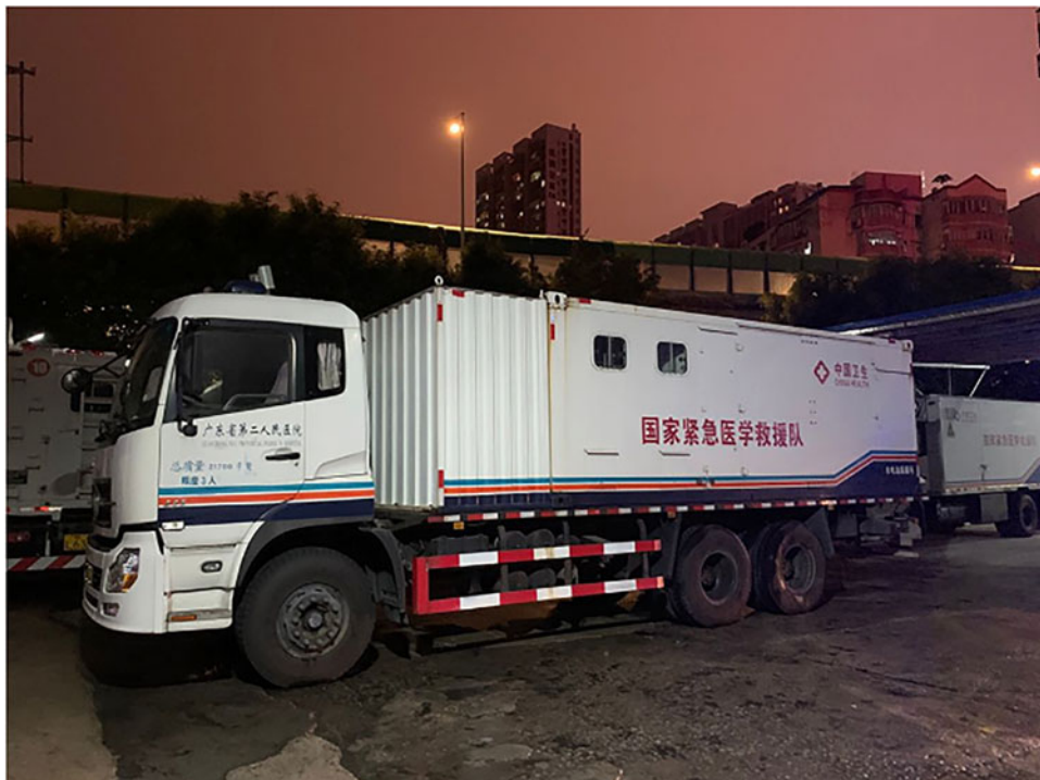
Rescue Material Delivery Vehicle of National Emergency Medical Rescue Team of the Second People's Hospital of Guangdong Province.