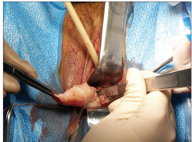
Figure 2: Vaginal morcellation of aborting fibroid