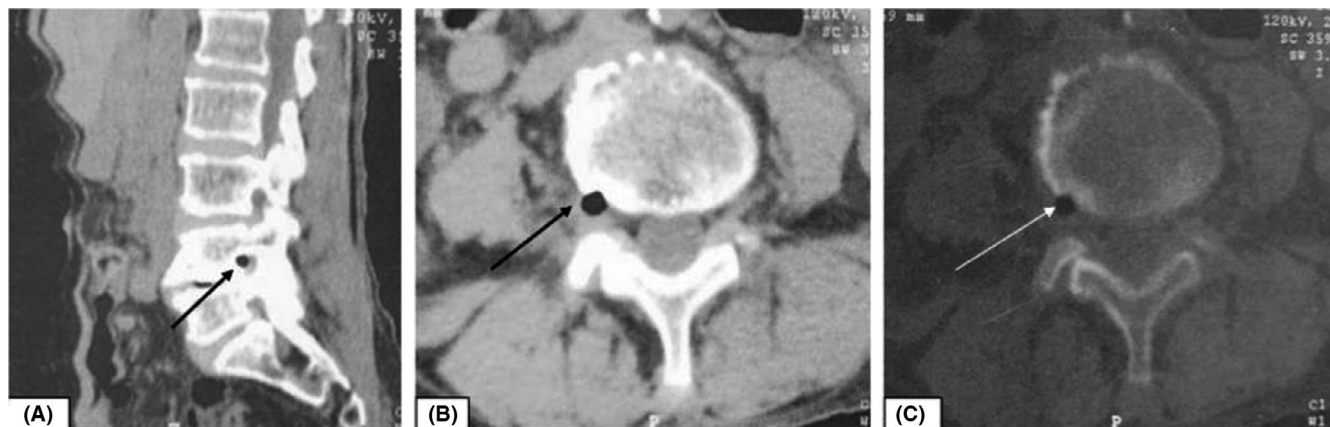
FIGURE 1 Spinal CT scan: Sagittal (A), axial (B, C) showing a vacuum disk phenomenon and moderate protrusion at L5–S1 space (arrows). A gas bubble was noticed in the right lateral recess at L4–L5 with probable evidence of right L4 root compression