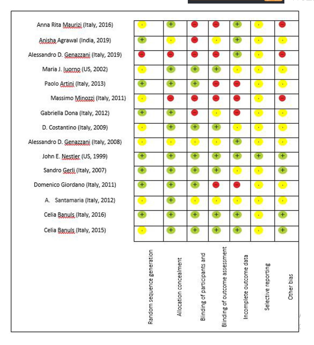
FIGURE 2 The results of quality assessment of included studies using Cochrane Collaboration's risk of bias tool