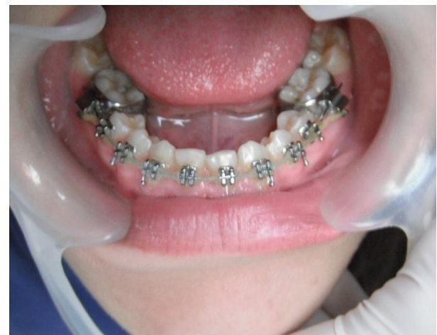
Fig. 4: Final aspect of inferior arch

It followed then the applying of a fixed poly-aggregate bimaxillary metallic appliance (Fig. 4-6).