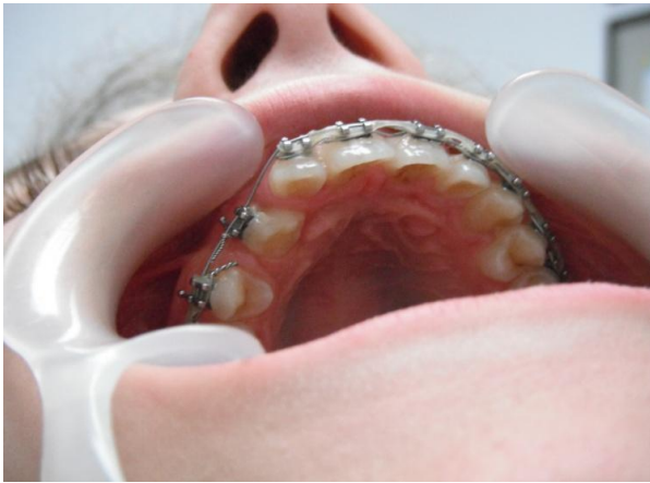
Fig. 5: Aspect of upper arch after 2 months