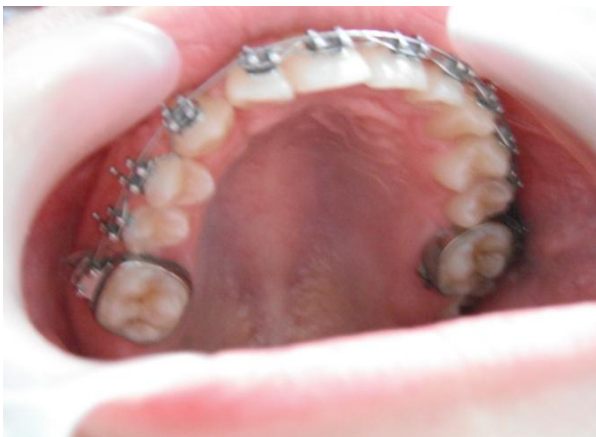
Fig. 6: Aspect of upper arch after 4 months