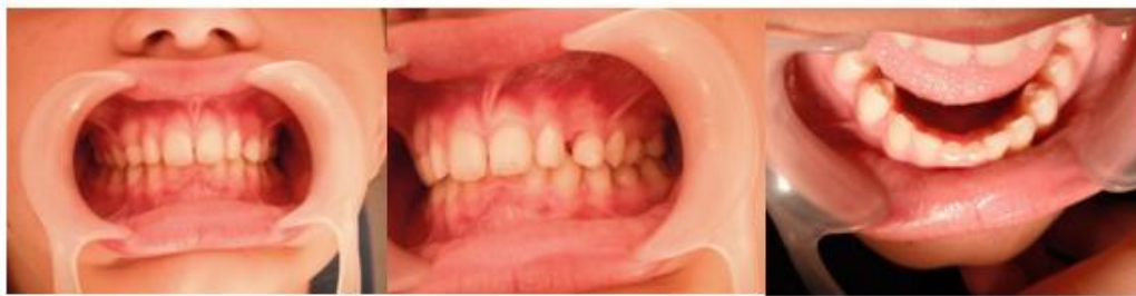
Fig. 1: Initial clinical aspect

At the clinical examination are observed the following (Fig. 1):