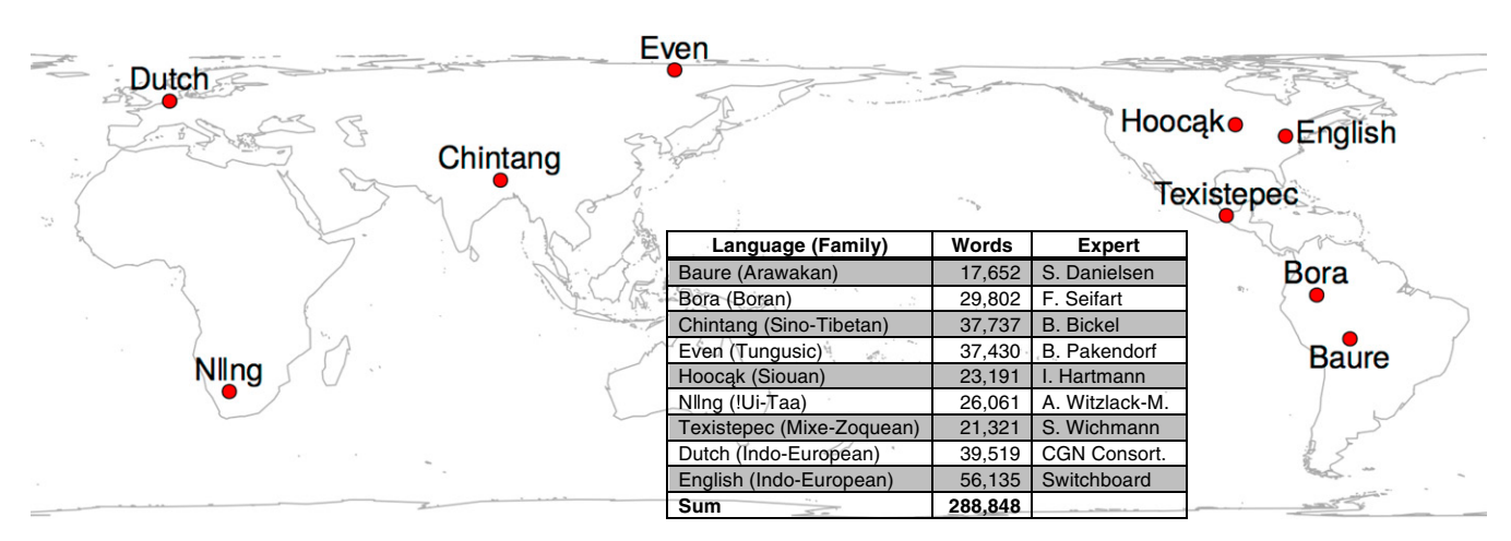
Fig. 1. Location of the nine languages and size of the corpora studied here. For detailed information, see SI Appendix, Table S1.

Results are summarized in the effect displays in Fig. 3, showing that all nine languages exhibit a significant slowdown before nouns compared with verbs with respect to at least one of our two ways of measuring slowdown. Only one language (English)