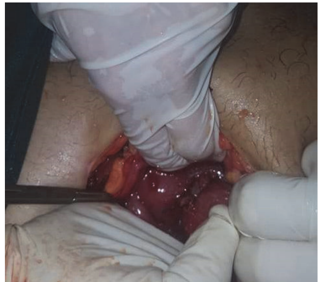
FIGURE 3: Repair of site of ectopic pregnancy and suction of blood.

saving the tubes and ovaries. The primary type is very rare; only 24 cases had been reported by 2007 [12].