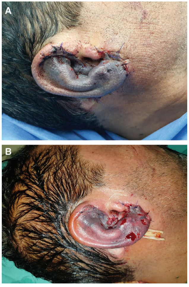
Fig. 2. Image showing an initial presentation to our institute 24 hours after injury with severe congestion (A), and then improvement on local LMWH protocol therapy with better resolution congestion day 6 post protocol (B).

The dressing technique conducted every day through warm saline gauze to induce vasodilatation and then neomycin-sulfate–impregnated wet to dry dressing to keep a moist environment for wound and to prevent desiccation. Small superficial epidermolysis of overlying conchal skin was noticed during daily dressing, and this was managed conservatively with local wound care and coverage with oral