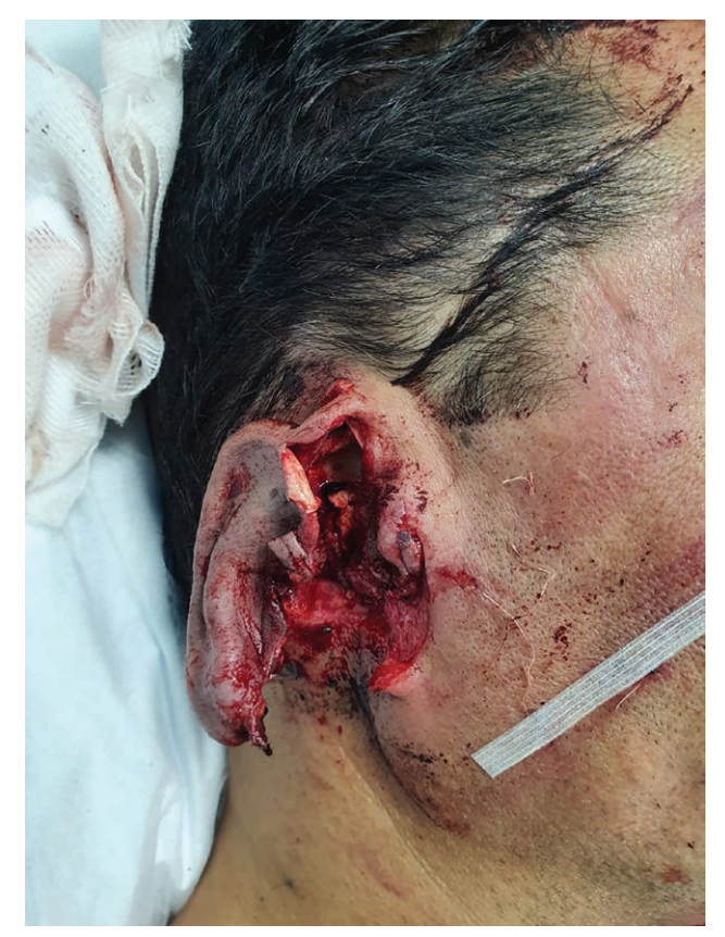
Fig. 1. Traumatic avulsion of the right ear skin and cartilage attached with small skin bridge.

perform microvascular anastomoses. All the possible management solutions were discussed with the patient and the use of local heparin injection therapy was acknowledged.