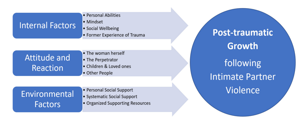
Figure 2. Facilitating factors in post-traumatic growth following intimate partner violence.

The overriding theme of the study was "I'm a winner, not a victim", which described the women's essential experience of PTG. They described their experience as a shift from being suffering victims of IPV to becoming winners who enjoyed PTG. They felt that their positive attitude and personal strengths had helped them to reach PTG, as well as to face the fact that they had been in an abusive relationship, thus forgiving and believing in themselves and taking responsibility for their own health and well-being. They sought knowledge about violence, how to process it, and how to respond to triggers. They set boundaries for their perpetrators and were in as little contact with them as possible. They chose the company of positive, supportive, and constructive people and situations where they were not being controlled. All participants had suffered emotional and psychological IPV as well as verbal abuse and oppression. Many of them also described physical and sexual violence as well as financial abuse. The women had all undergone the shift from suffering victims of IPV to winners who enjoyed PTG, and they described the factors that facilitated their PTG. They saw the journey to PTG as an ongoing process, where certain factors facilitated their PTG. The findings of these facilitating factors among women who suffered IPV are presented in Figure 2.