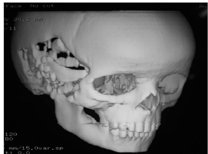
Figure 4: Three-dimensional recon image showing split calvarial bone graft placed intraoperatively

temporalis muscle. The underlying temporal bone was thinned out and was perforated during exploration through which dark-colored blood was seen coming out from the lesion. The tumor was well-defined capsulated and was soft in consistency involving the adjacent petrous temporal bone and greater wing of sphenoid. The zygomatic bone was also removed. The tumor was densely adherent to the underlying dura, which was torn during dissection. To ensure a complete removal of the lesion, the cyst was removed along with the underlying adherent dura with a sufficiently wide margin. The dural defect was then repaired with artificial dura. Total surgical excision was achieved. Cranioplasty was achieved from the normal bone taken from the surroundings of the lesion. Split calvarial bone graft pieces [Figure 4] were harvested from this normal bone and these pieces were then used to bridge the bony defect which was caused due to removal of the bony lesion.