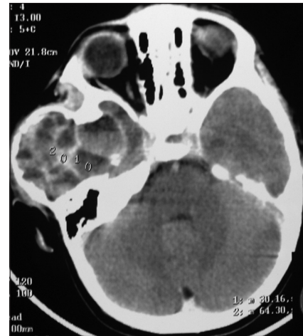
Figure 2: Computed tomography scan head (plain and contrast) showed an extra axial, heterogeneous mixed density mass in the right temporal region with multiple internal loculations and fluid levels, taking variegated contrast enhancement