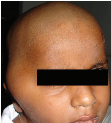
Figure 1: Subject with swelling in the right temporal region