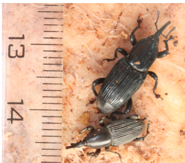
Figure 1. Adult banana (pseudo)stem weevil, Odoiporus longicollis (OL)—larger weevil facing top right corner of photo and adult banana weevil, Cosmopolites sordidus (CS)—smaller weevil at bottom of photo facing ruler.

the burrowing nematode ( Radopholus similis ) [14] and the fungal disease Black Sigatoka, caused by Mycosphaerella fijiensis [15]. The biosynthesis of the phenylphenalenones is closely related to that of flavonoids. Both classes of natural products are derived from the phenylpropanoid/plant polyketide pathway [16,17]. The present study focuses on phenylphenalenone-type compounds produced by two different banana varieties, Musa acuminata cv. “Grande Naine” (GN) and M. acuminata × balbiana Colla cv. “Bluggoe” (BG) in reaction to banana weevils (CS) and banana pseudostem weevils (OL) feeding on the plants.