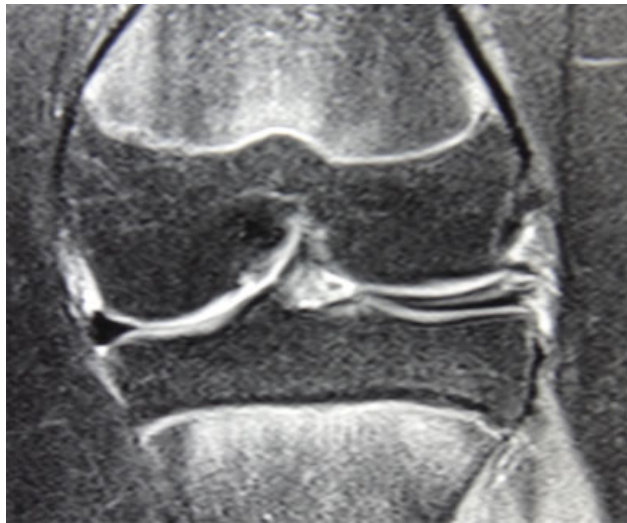
Fig. 1 Coronal slice of MRI showing discoid lateral meniscus with complex horizontal tear. MRI, magnetic resonance imaging.