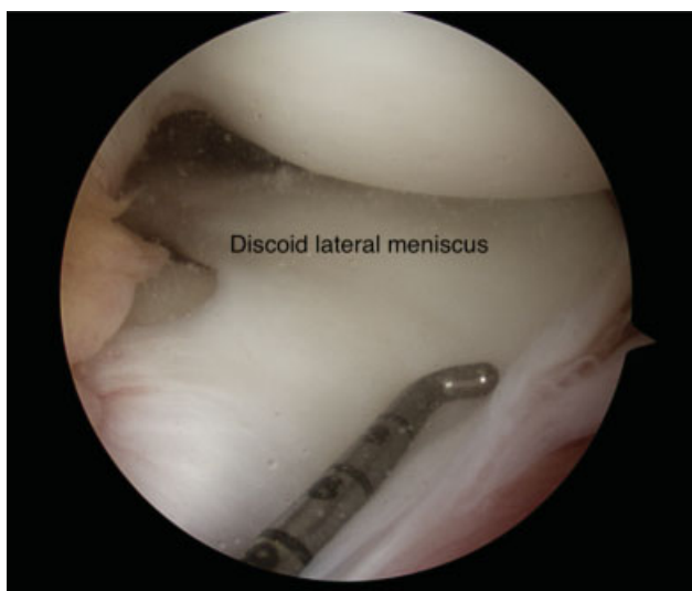
Fig. 2 Incomplete discoid lateral meniscus with vertical tear involving anterior horn.

Kim et al 4 described a similar technique of repairing tears of anterior horn of lateral meniscus. Using three portals, lateral patellofemoral axillary portal as the viewing portal, standard anterolateral, and far medial portal, the tear was approached