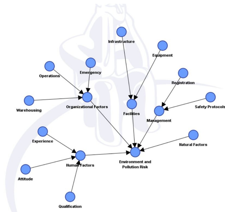
Fig 1. DAG of the developed model.

After running the model in the BayesiaLab environment, the inference results drawn as shown in Fig 2, indicates that accidents with noticeable pollution, property and monetary losses had