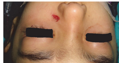
FIGURE 4: Photograph of the patient after removal.

radiographs. Patients coming in the emergency with blast injuries and penetrating trauma should undergo radiological investigation before operation. Waters and lateral skull views are useful imaging tools in diagnosing FB and CT scan can be usefully used to evaluate the presence and exact location of FB [8, 13, 14].