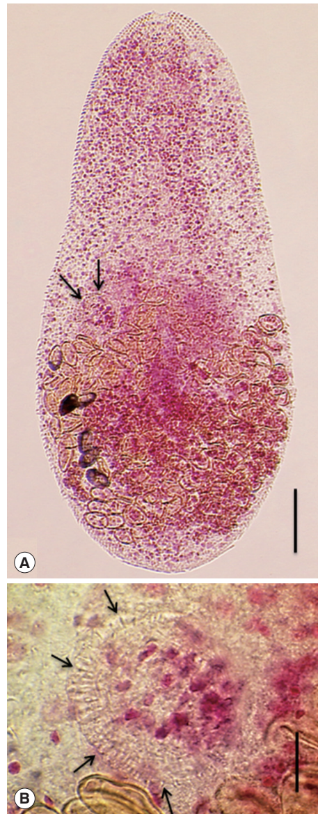
Fig. 2. An adult specimen (A, B) of H. pumilio . (A) The adult fluke (0.62 mm long) was recovered from a patient in Kham District after chemotherapy and purging. The gonotyl (arrows) is seen on the right side of the worm. Scale bar=0.07 mm. (B) A close-up view of the gonotyl and gonotyl spines (arrows). About 40 small chitinous spines are seen on this worm. Scale bar=0.04 mm.

A total of 2,686 helminth specimens (2,487 trematodes, 191 nematodes, and 8 cestodes) were collected from the diarrheic stool of 12 patients (A-L) after anthelmintic treatment and purging (Table 2). They comprised 8 species, including 2 Haplorchis spp., C. formosanus (reported previously by Chai et al. [12]), O. viverrini , Taenia saginata (reported previously by Jeon et al. [17]), and 3 species of nematodes (2 hookworm species and E. vermicularis ). Hookworm species consisted of Ancylostoma duodenale and Necator americanus at an approximate ratio of 6:4. Trematodes were predominantly composed of Haplorchis spp., with the great majority being H. pumilio (91.2%; 2,268/2,487 specimens) (Fig. 2) and a few being H. taichui (3.7%; 93/2,487 specimens), C. formosanus (4.9%; 122/2,487 specimens), and O. viverrini (0.2%; 4/2,487 specimens). Lecithodendriids were not recovered. Eight Taenia saginata specimens were recovered from 7 patients (Table 2).