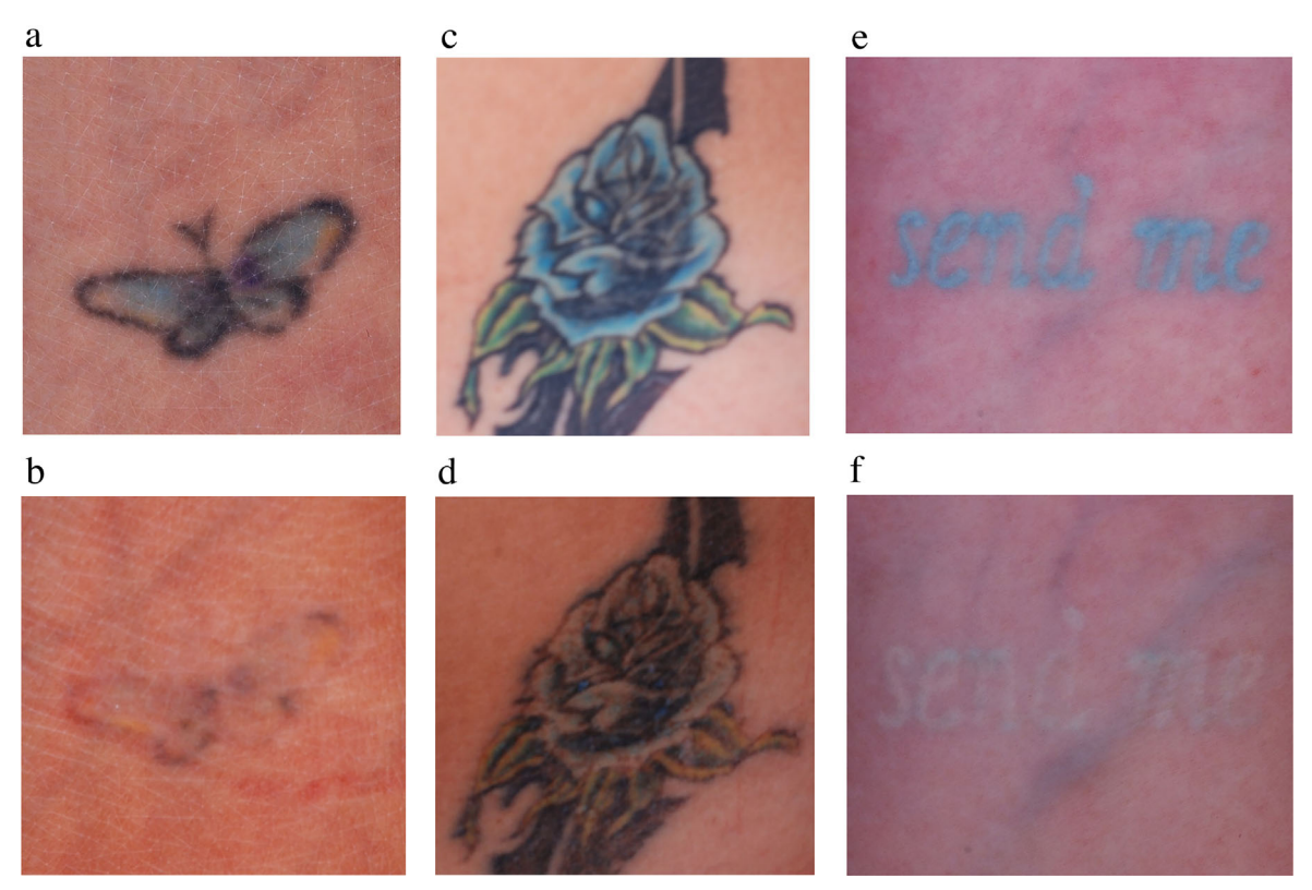
Fig. 1. Cross-polarized, digital images taken before (\mathbf{a}, \mathbf{c}, \mathbf{e}) laser treatment and after (\mathbf{b}, \mathbf{d}, \mathbf{f}) the 4th treatment. Purple, blue, and green pigment cleared almost completely, while some residual yellow and black ink are clearly visible. Cross-polarized photography enhances visibility of tattoos over conventional lighting or non-polarized flash photography.

compared to the 755 nm alexandrite and 532 nm KTP lasers. Because the 1,064 nm Nd:YAG wavelength is the longest available, it is also the least likely wavelength to target epidermal melanin pigment causing hypopigmentation, an unwanted side effect when treating tattoos. Black ink also tends to require more treatments compared