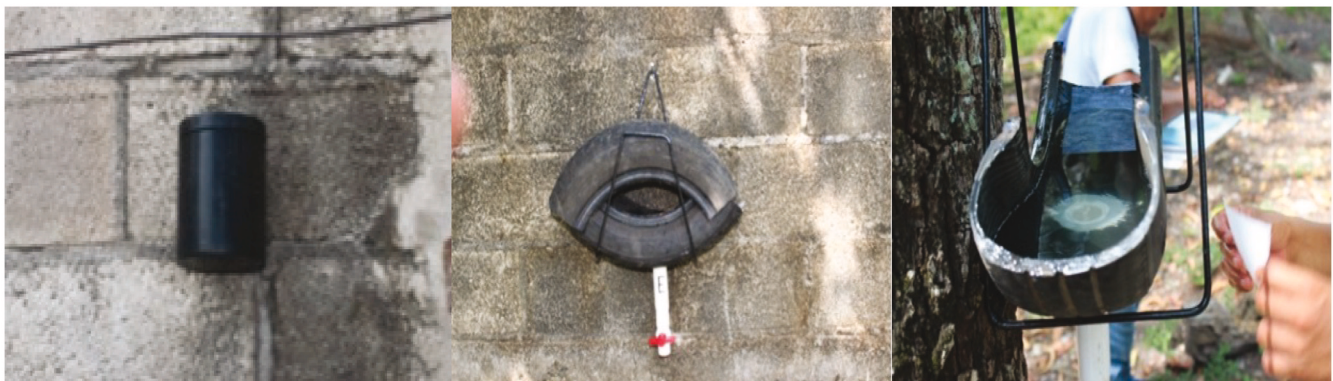
Figure 1. Recycling of a tire to reduce the Aedes spp. mosquito using directed oviposition. a) Classical ovitrap b) Covered ovillanta c) Inside an ovillanta showing the landing strip.

To overcome these limitations, other ovitraps have appeared on the market – some force the larvae to a confined, flooded partition where they die because they cannot reach the surface and breathe. Others contain glue or larvicidal compounds, chemical or biological (e.g. Bacillus thuringensis , fish ' Poecillia maylandi '), to rapidly destroy the larvae. Each of these new traps has monitoring merits,