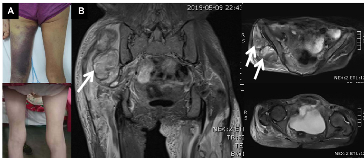
Figure 1 (A): The patient's right buttock and left thigh was obviously enlarged. There was ecchymosis over left thigh (above). The ecchymosis disappeared after 3 months (below). (B): T2 weighted imaging of magnetic resonance imaging showed occupying lesion (probably hematoma, see white arrows) deep under the right gluteus maximus, and the signal of muscles and other soft tissues around the pelvis and femur increased widely.