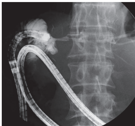
FIGURE 3: Contrast agent was stagnant around the anastomosis.

MS can reduce recurrences of cholangitis and achieve long-term patency.