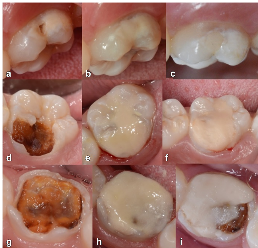
Fig. 2 12-month follow-up and restorative failure. a, d, g - initial aspect of MIH affected molars associated with carious lesions at baseline; b, e, h - clinical aspect of restorations immediately after being performed using the ART technique involving 1 surface ( b ), 2 surfaces ( e ) and all surfaces ( h ); c, f, i - clinical aspect of restorations after 12 months ( c and d ) and the only failure observed ( i ) which occurred after 6 months follow-up

Within 6 months of evaluation, one failure was recorded (Fig. 2g-i) and was classified as 6 using the modified ART criterion [24], which characterizes fracture of the restoration and/or tooth in need of repair. The remaining restorations were classified as codes 1 (54 restorations, 90%) (Fig. 2a-f) and 2 (five restorations, 8.33%), which indicates good condition or marginal wear of less than 0.5 mm with no need for repair, respectively.