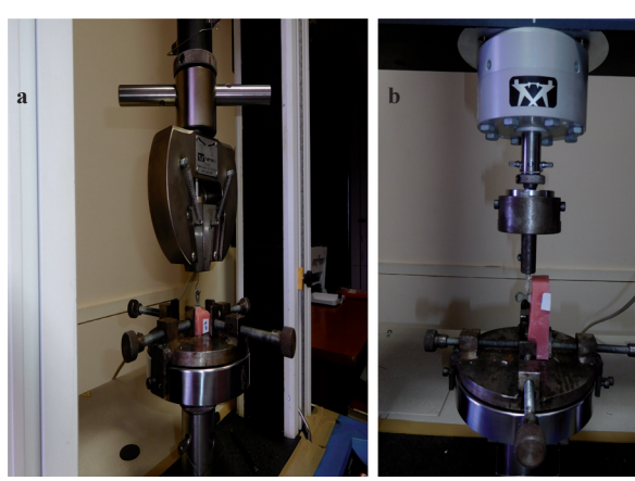
Fig. 2: a) Measurement of tensile bond strength on universal testing machine. b) Measurement of shear bond strength on universal testing machine.

The bond strength(MPa) was calculated by (1): (Fig. 3).