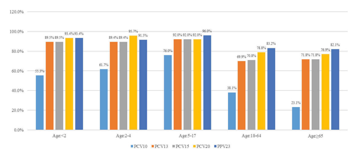
Figure 3. Vaccine coverage rates by age subgroups. Data are expressed by %; numbers of patients were divided by 5 age subgroups (n): <2 (76), 2–4 (47), 5–17 (25), 18–64 (113), and ≥65 (39)

(89.9%, 95% CI: 83.8, 94.2; 93.2%, 95% CI: 87.9, 96.7; 89.9%, 95% CI: 83.8, 94.2; 93.9%, 95% CI: 88.8, 96.8) as compared with those in the adult group.