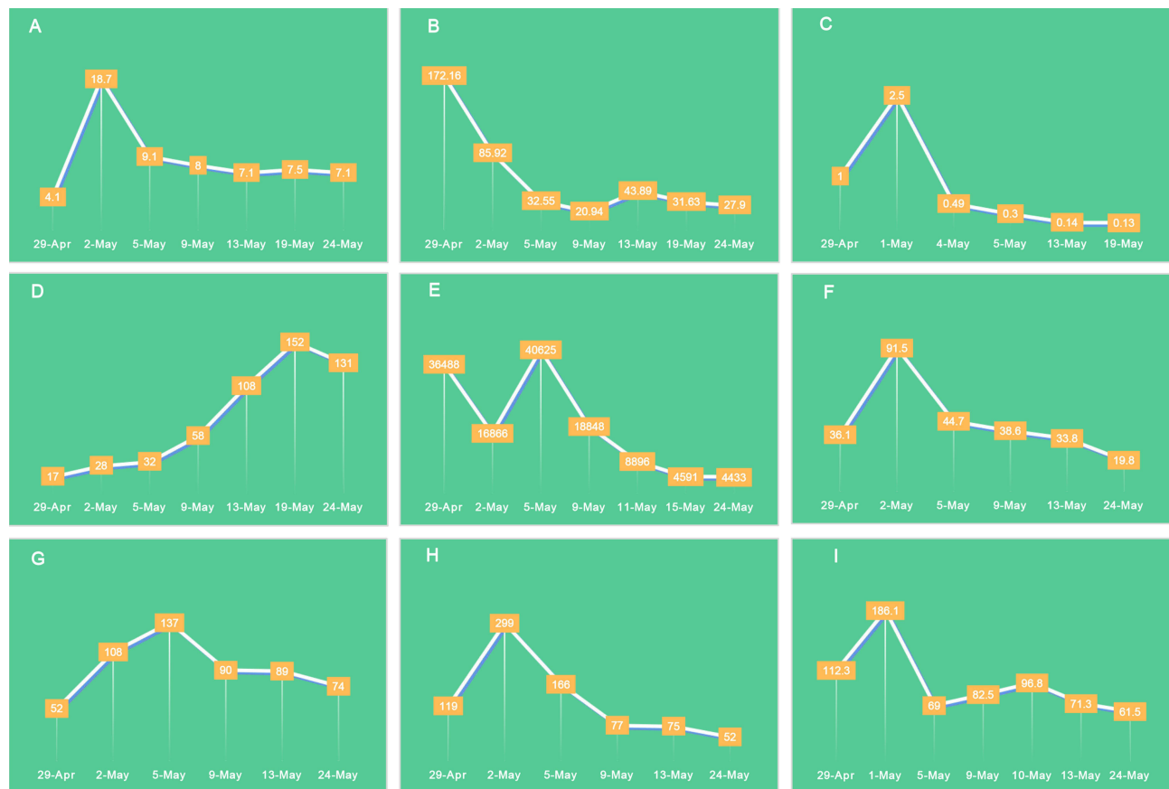
Figure 2 (A) The tendency of white blood cell value ( 10^9/L ) during hospital stays. (B) The tendency of high-sensitivity C-reactive protein value (mg/L) during hospital stays. (C) The tendency of procalcitonin value (ng/mL) during hospital stays. (D) The tendency of platelet value ( 10^9/L ) during hospital stays. (E) The tendency of D-dimer value ( \mu g/L ) during hospital stays. (F) The tendency of total bilirubin value ( \mu mol/L ) during hospital stays. (G) The tendency of alanine aminotransferase value (U/L) during hospital stays. (H) The tendency of aspartate aminotransferase value (U/L) during hospital stays. (I) The tendency of serum creatinine value ( \mu mol/L ) during hospital stays.

the species or the RPM (sample) / RPM (NC) \geq 5 , which was determined empirically according to previous studies as a cutoff for discriminating true-positives from background contaminations.