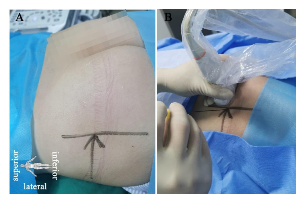
Figure 2. Positioning of the patient and the puncture with the ultrasound-guided improved pudendal NB/PRF technique. Patient with pudendal neuralgia in the prone position ( A ) and needle punctures in-plane into the lateral end of the low-frequency ultrasound transducer ( B ).

After positioning the PN patient in a prone position (Figure 2), a low-frequency ultrasound curved array transducer (SIEMENS, KT-LM170SDS, ACUSON X300, Malvern, PA, USA) is placed in the area of the ilium (Figure 3A), which corresponds to the anatomical position (Figure 3B) (VESAL 3D ANATOMY, Xi'an, China, 4.5.2). After identifying the continuous hyperechoic line of the ilium area, the ultrasound transducer is slowly moved parallel downward from superior to inferior to reveal the three key anatomical position areas, including the piriformis, ischial spine, and underneath the ischial spine between the ischial spine and ischial tuberosity (Figure 3C–H), and then moved slightly back to the plane of the ischial spine. The physician localizes the pudendal nerve around the internal pudendal artery at the plane of the ischial spine under ultrasound direction and then uses a 22 \text{ G} \times 0.7 \text{ mm} \times 80 \text{ mm} needle to puncture the internal pudendal artery laterally and then injects 5 mL of the mixed liquid (the same concentration and dose of drug as the conventional pudendal NB group).